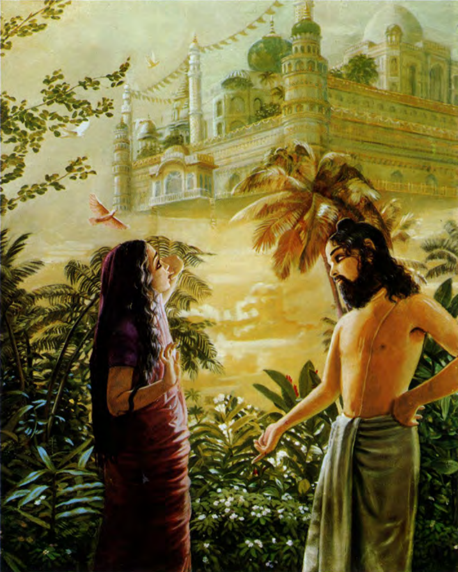
Plate 4 The sage Kardama instantly produced an aerial mansion by his yogic power. (p. 915)