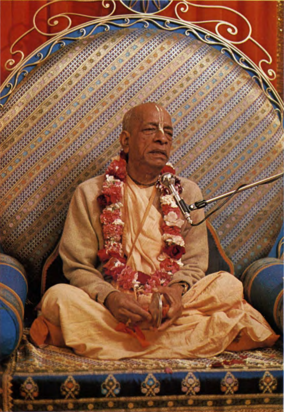
His Divine Grace A.C. Bhaktivedanta Swami Prabhupāda Founder-Ācārya of the International Society for Krishna Consciousness