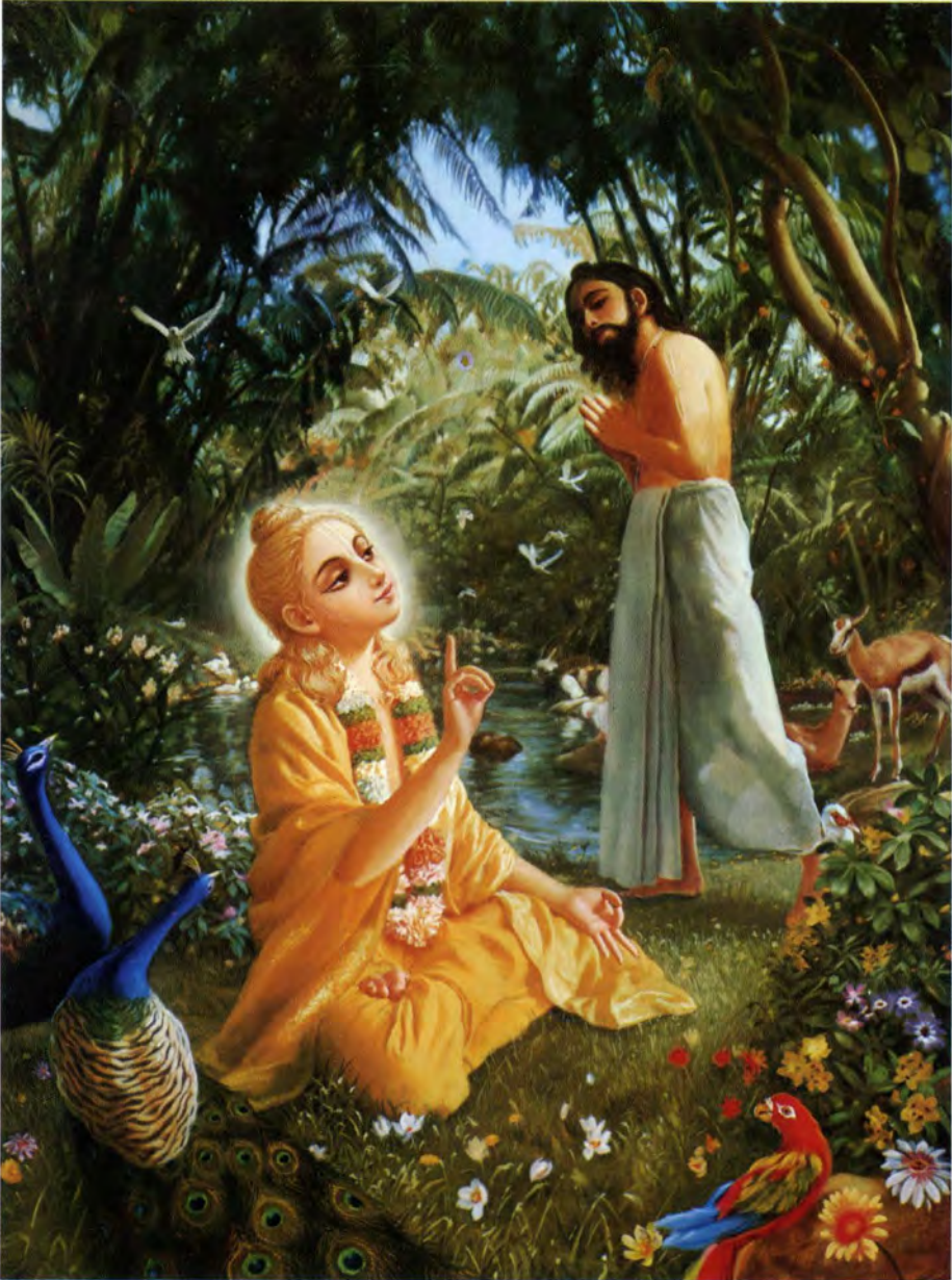
Plate 7 "O Muni, because I told you before that I would become your son, I have descended to fulfill this truth." (p. 984)