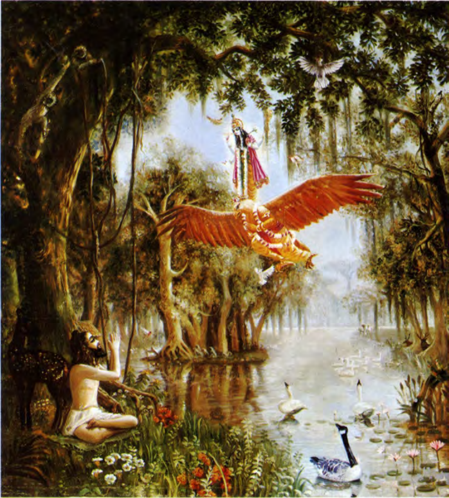
Plate 3 The Lord appeared before Kardama Muni with His lotus feet placed on the shoulders of Garuda. (p. 810)