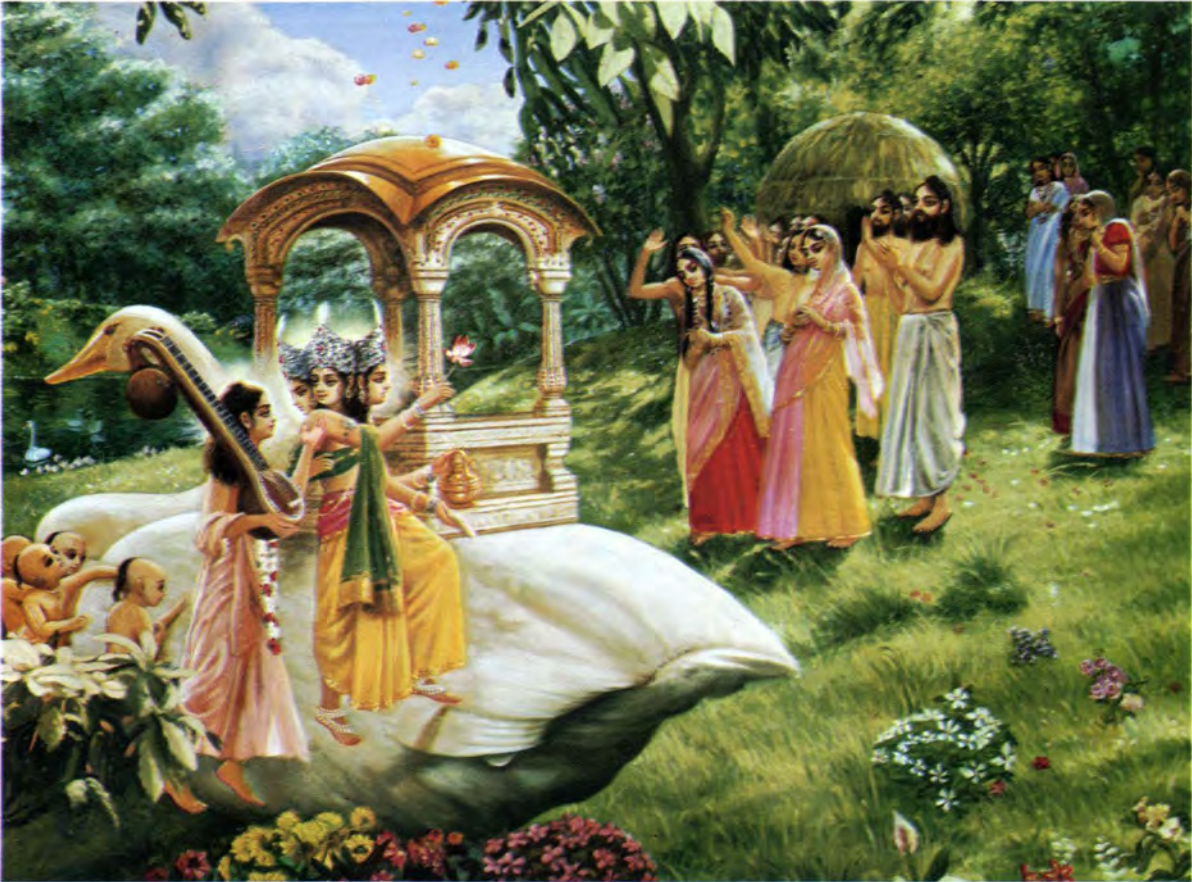
Plate 6 After speaking to Kardama Muni and Devahūti, Lord Brahmā left for his abode. (p. 970)