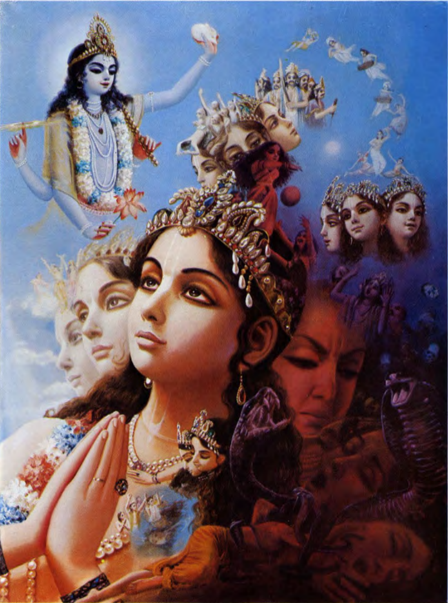
Plate 2 On the order of the Supreme Lord, Brahmā cast off his impure body. (p. 779)