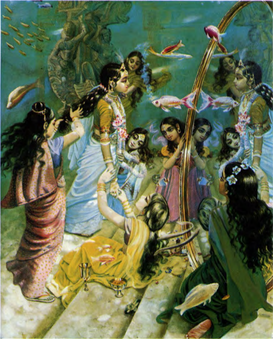
Plate 5 The girls very respectfully bathed Devahūti with valuable oils and ointments. (p. 925)