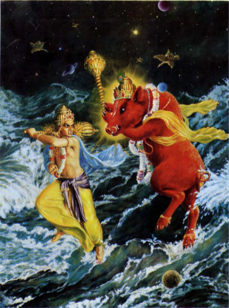
Plate 1 The demon and the Lord struck each other with their huge maces, each enraged and seeking his own victory. (p. 715)