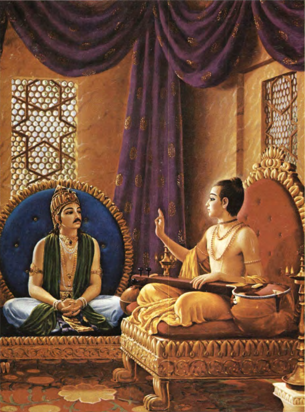
Plate 1 The great saint Nārada became very compassionate upon the King and decided to instruct him about spiritual life. (page 1135)