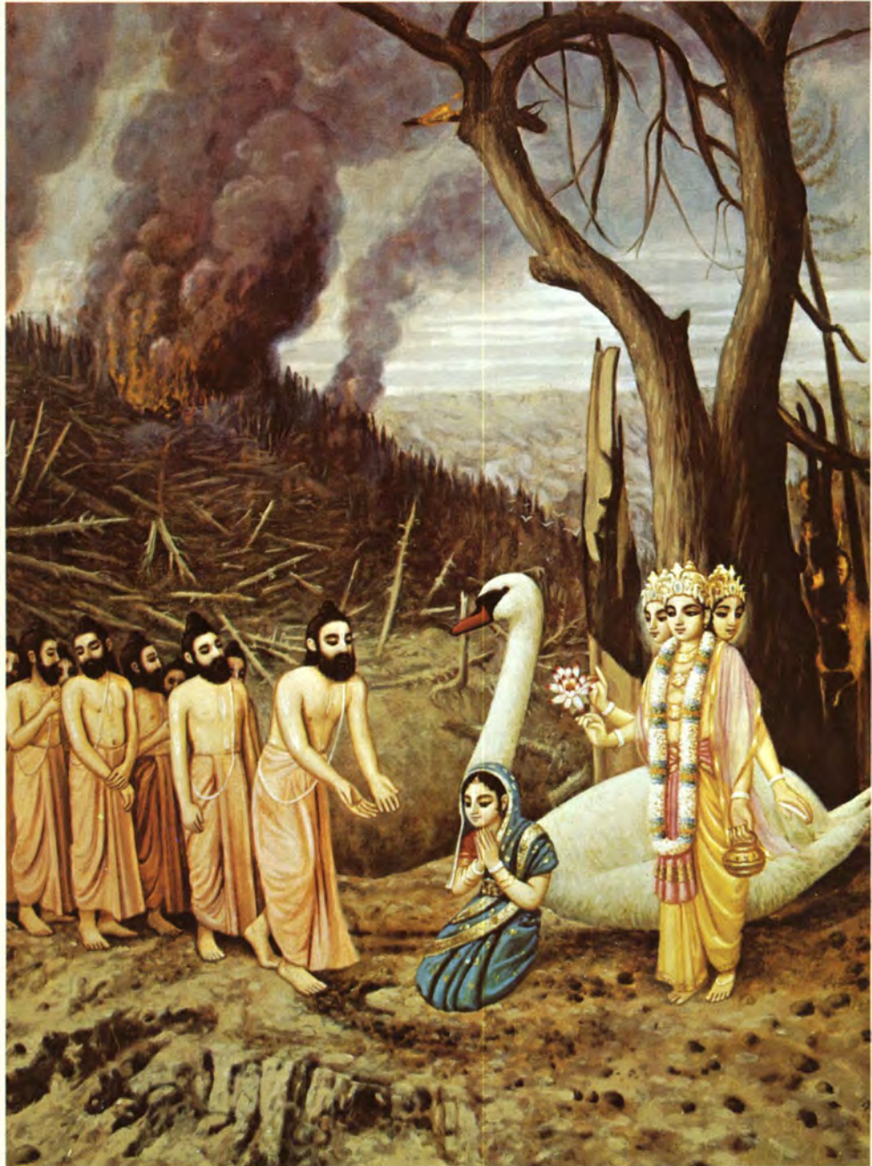
Plate 7 The remaining trees, being very much afraid of the Pracetās, immediately delivered their daughter at the advice of Lord Brahmā. (page 1548)