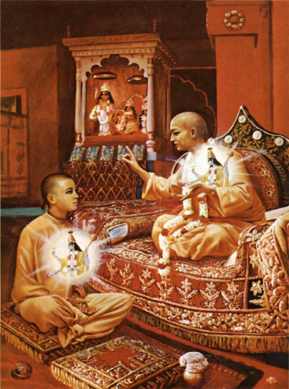
Plate 5 Consulting a bona fide spiritual master is the same as consulting the Supreme Personality of Godhead personally. (page 1430)