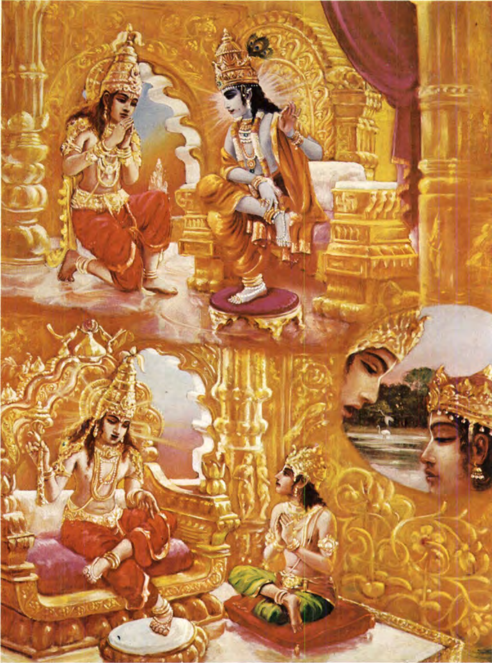
Plate 2 Lord Kṛṣṇa imparted the imperishable science of yoga to the sun-god, Vivasvān, who instructed it to Manu, the father of mankind, who in turn instructed it to Ikṣvāku. (page 1323)