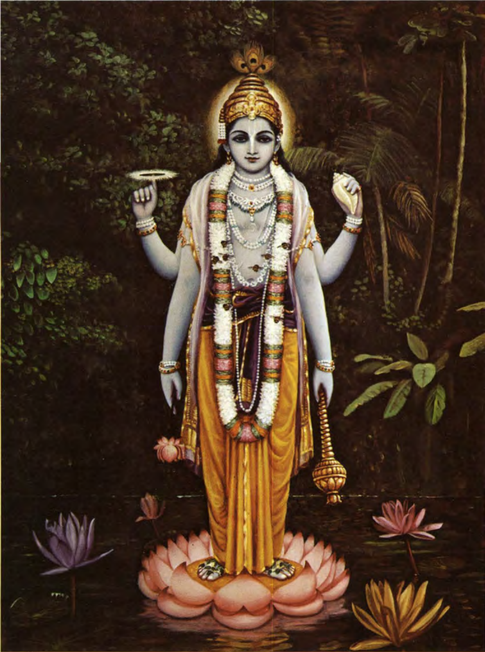
Plate 3 The Supreme Lord is the Supreme Spirit, the Supersoul. (page 1358)