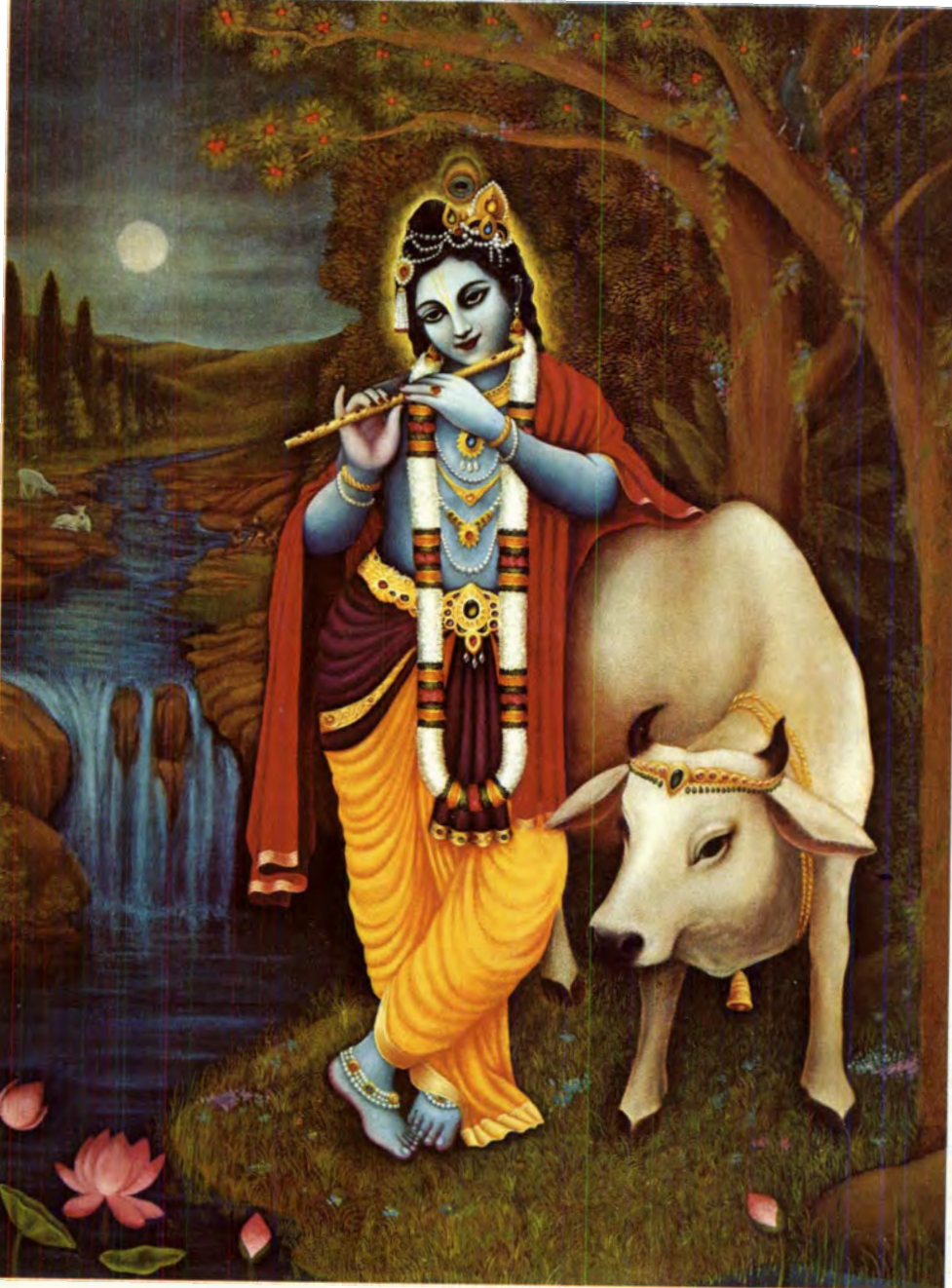
Plate 4 The perfect result of an education is the fixing of one's mind on the lotus feet of Kṛṣṇa. (page 1428)