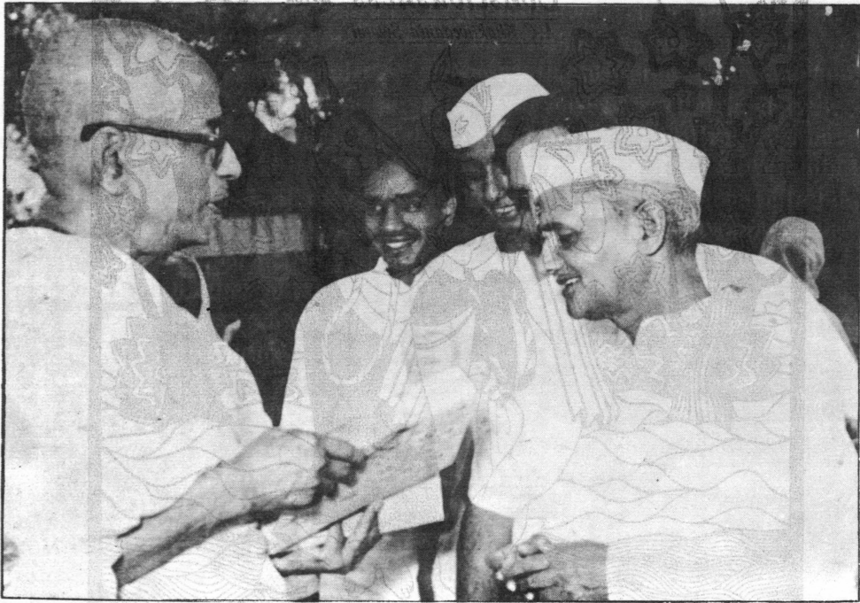
Swami Bhaktivedanta receiving the praises of the late Prime Minister Lal Bahadur Shastri for his work in translating and editing the "Bhagwatam."

It has been said that one who approaches the transcendental message of the Srimad Bhagwatam has done so only after many, many births in pursuit of Truth. Now this sublime work, revealing the Glories and Pastimes of the Infinite Godhead, is at last available in English, along with Sanscrit text, Roman transliteration, English equivalents, and commentary—rendered by Swami A. C. Bhaktivedanta, the leading figure in the international Vaishnava (Devotional) movement today. Classical Vedic civilization, philosophy, sociology, politics, economics, and the deathless principles of Divine Love are here given elaborate attention by the authentic representative of these principles: a devotee in the line of disciplic succession which goes back to the days of Krishna's Appearance in this world. Price: $16.80 for 3 volumes (1200 pages).