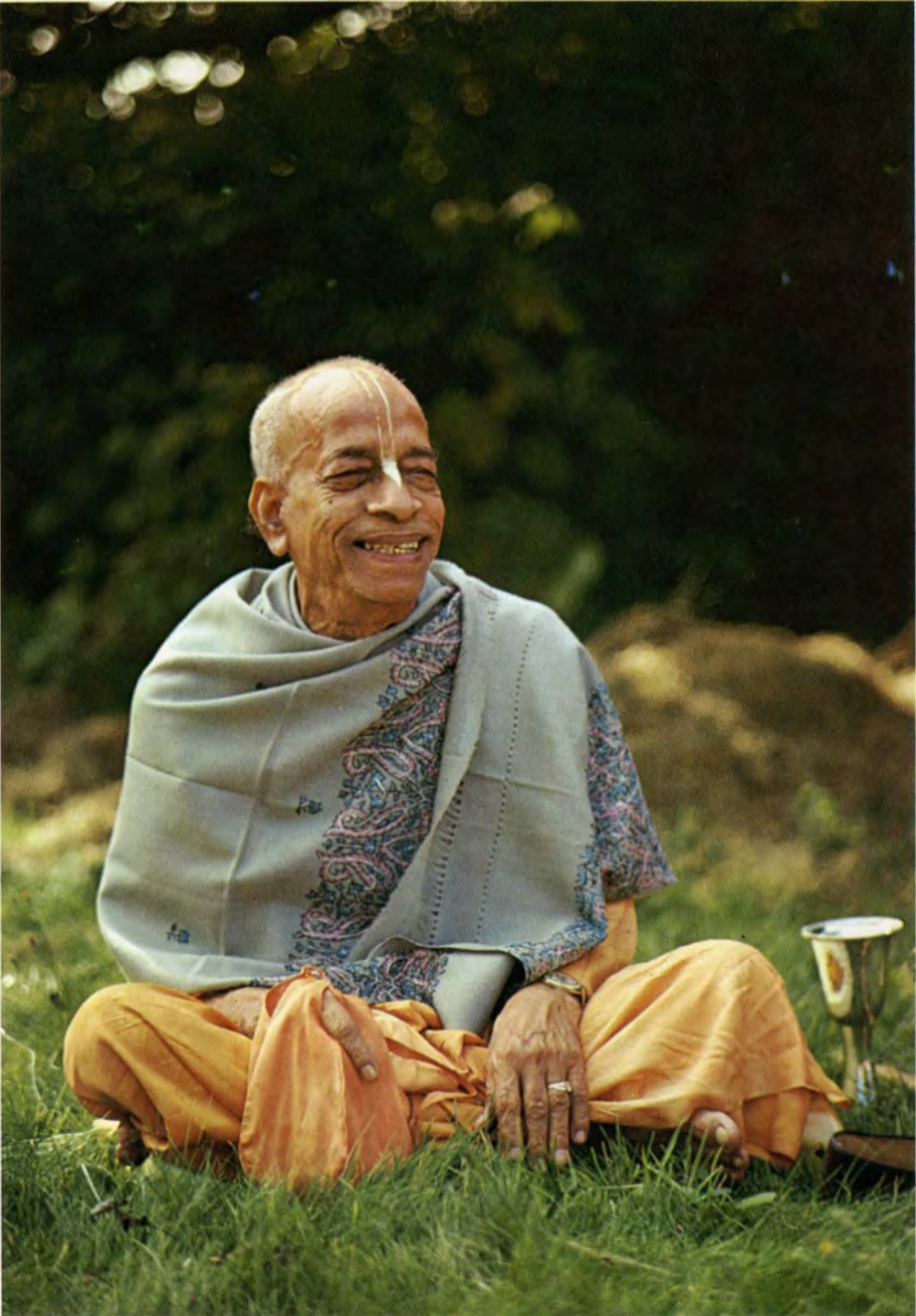
His Divine Grace A.C. Bhaktivedanta Swami Prabhupāda Founder-Ācārya of the International Society for Krishna Consciousness