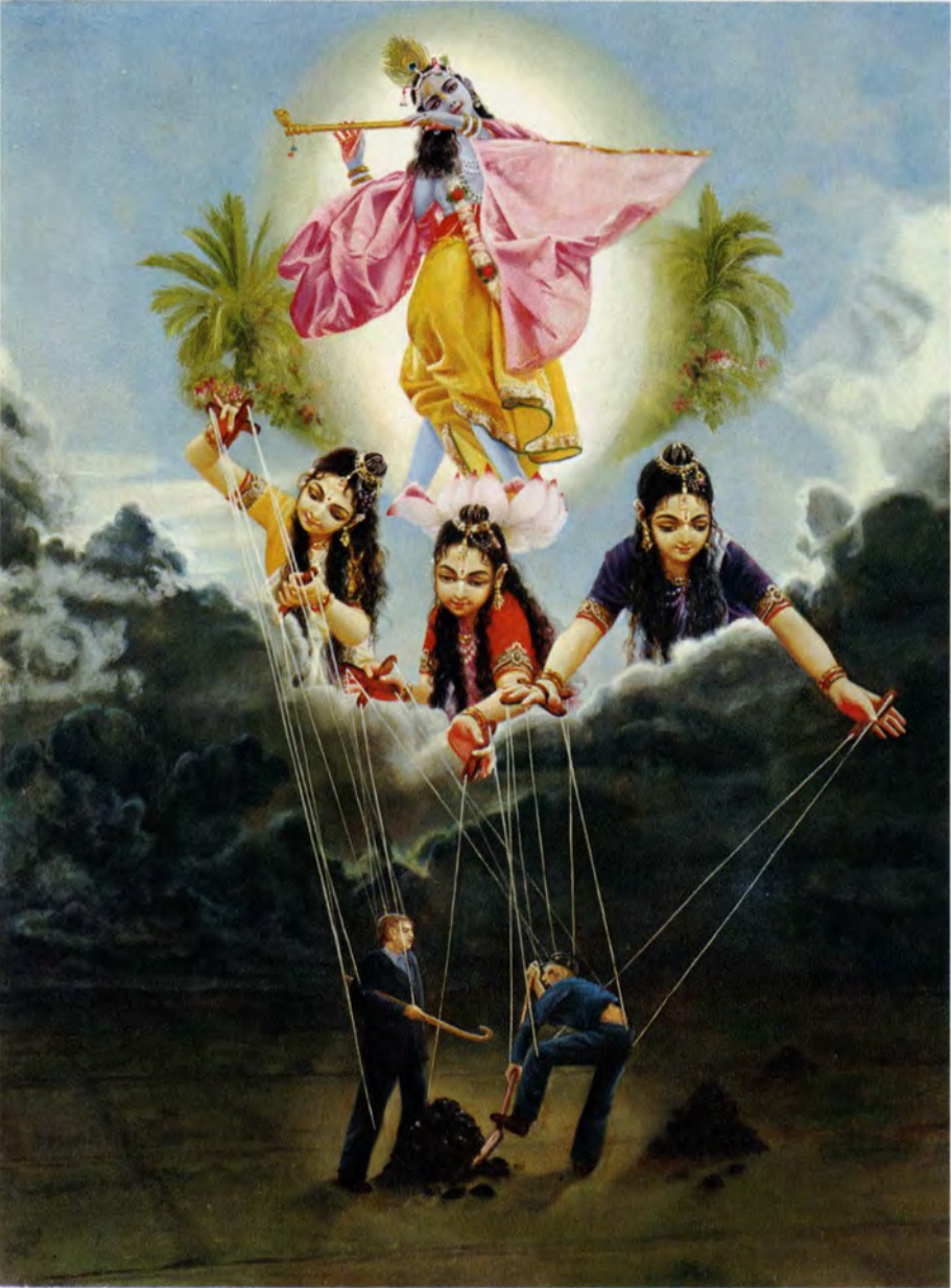
Plate 2 "You are eternally the master of the three modes of material nature; thus You are always different from the ordinary living entities." (p. 382)