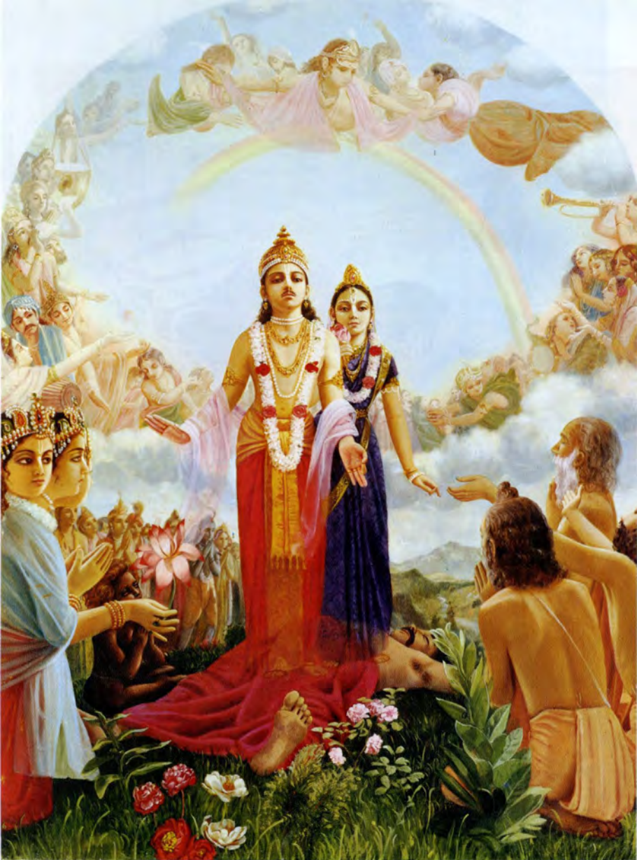
Plate 7 The male and female born of the arms of Vena's body were an expansion of Viṣṇu, the Supreme Personality of Godhead. (p. 622)