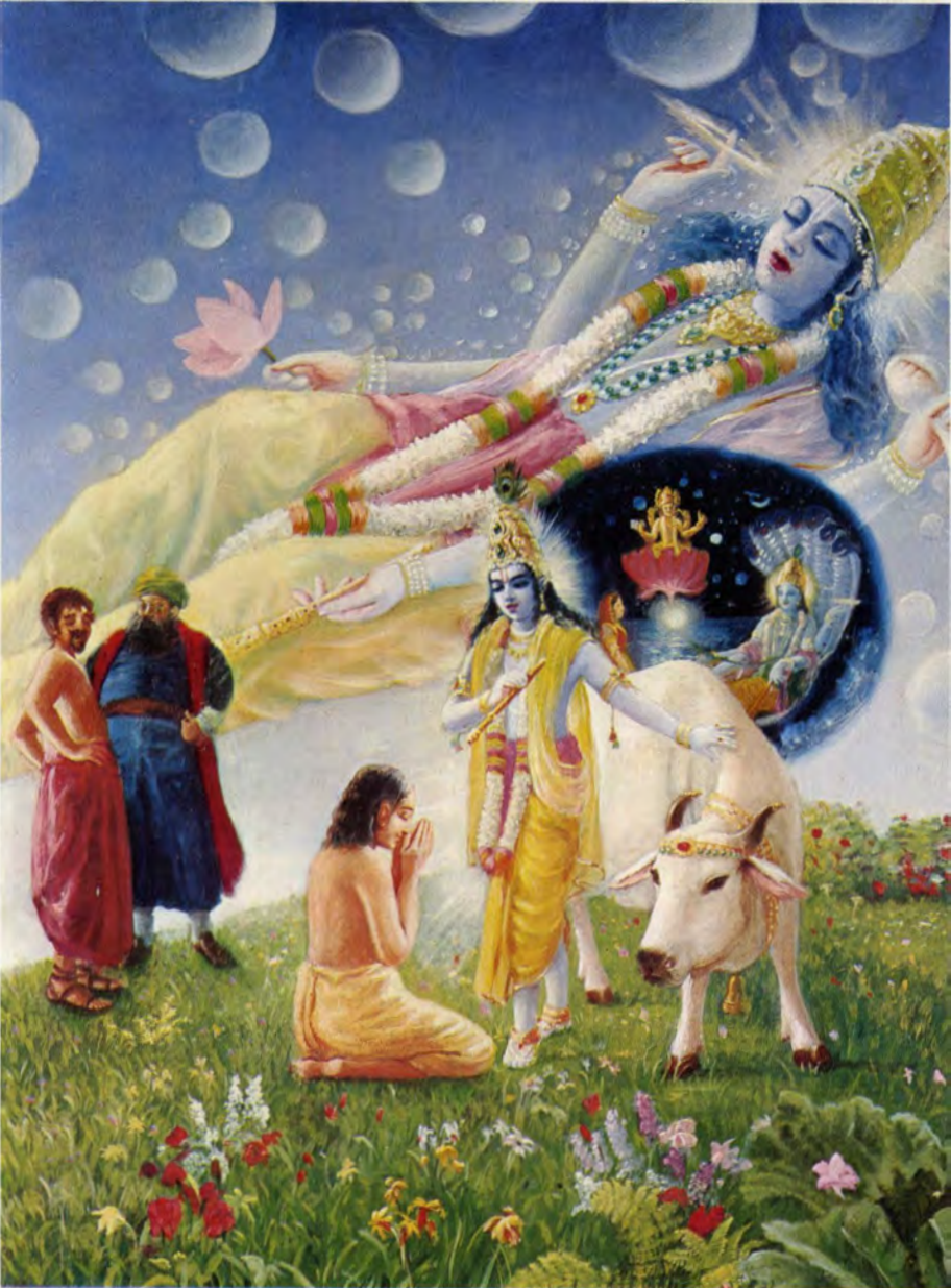
Plate 5 The Supreme Lord is transcendental to this material world; therefore only a fool thinks of Him as an ordinary human being. (p. 477)