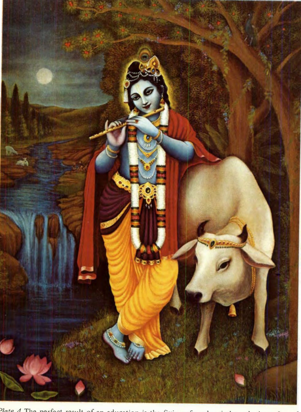
Plate 4 The perfect result of an education is the fixing of one's mind on the lotus feet of Krsna. (page 1428)