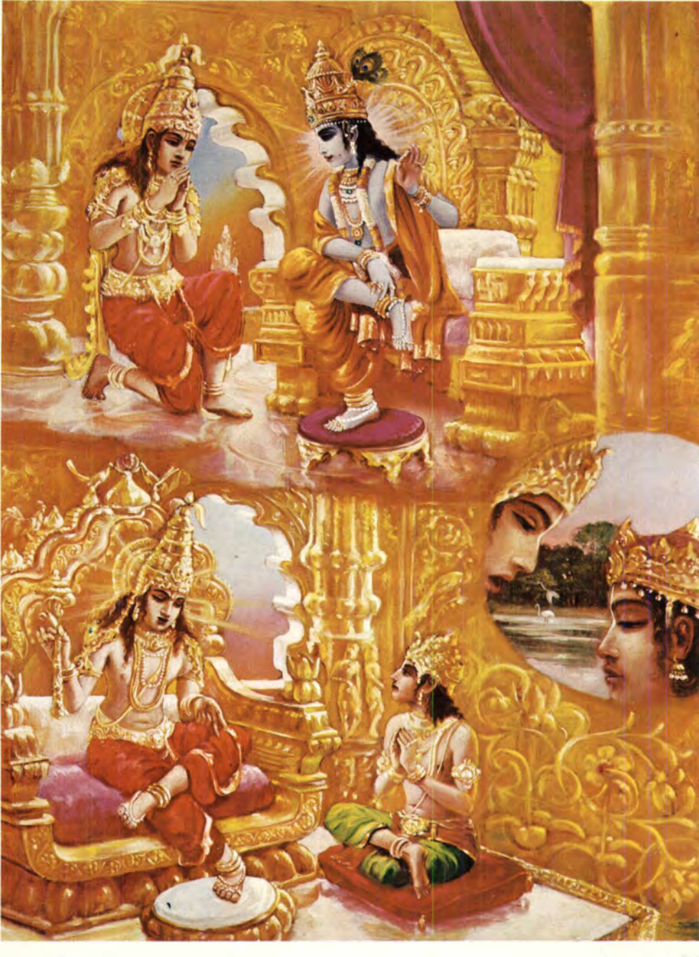
Plate 2 Lord Kṛṣṇa imparted the imperishable science of yoga to the sun-god, Vivasvān, who instructed it to Manu, the father of mankind, who in turn instructed it to Ikṣvāku. (page 1323)