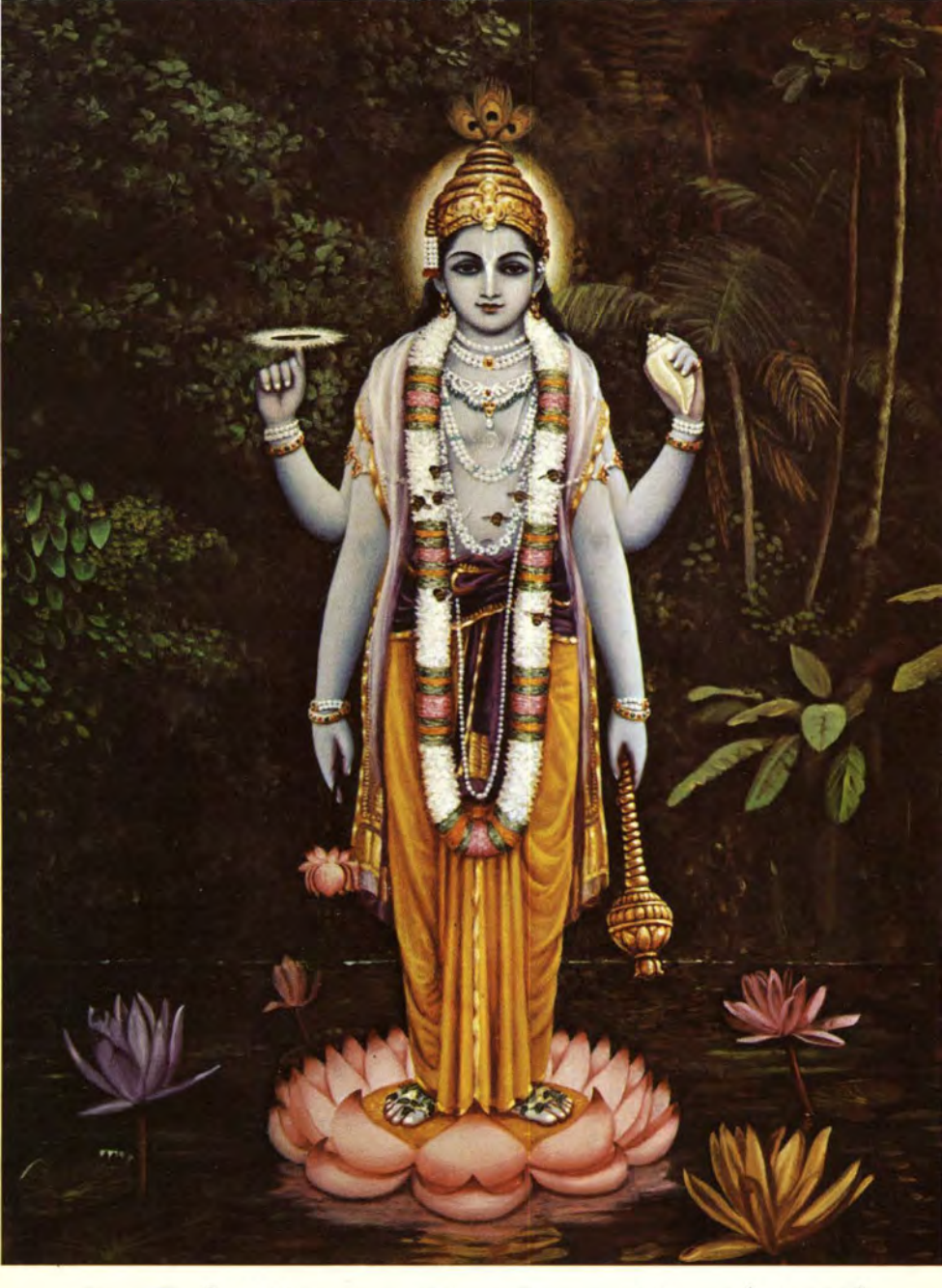
Plate 3 The Supreme Lord is the Supreme Spirit, the Supersoul. (page 1358)