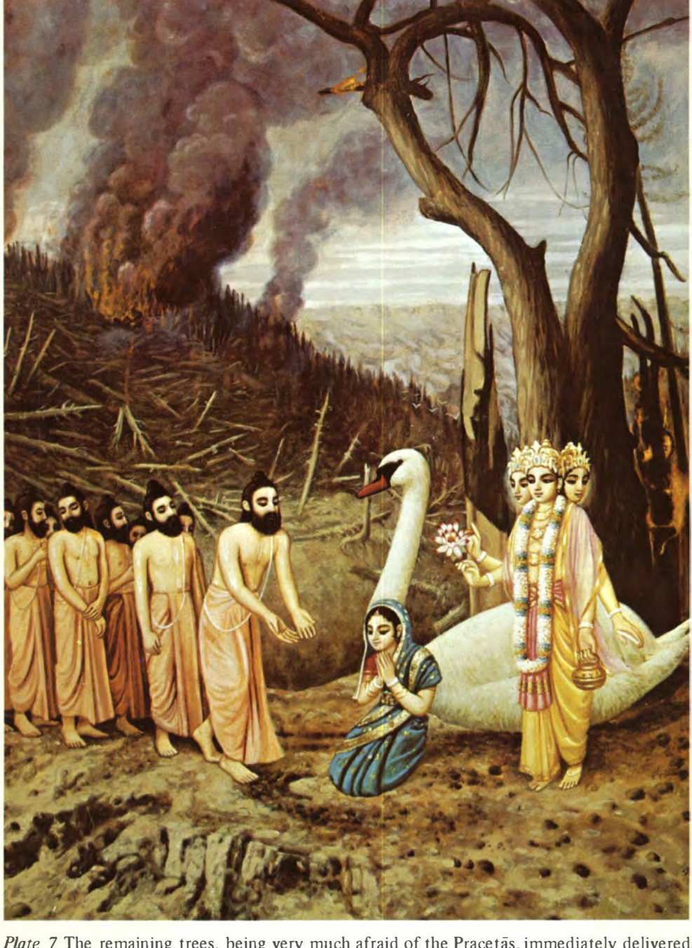
Plate 7 The remaining trees, being very much afraid of the Pracetas, immediately delivered their daughter at the advice of Lord Brahma. (page 1548)