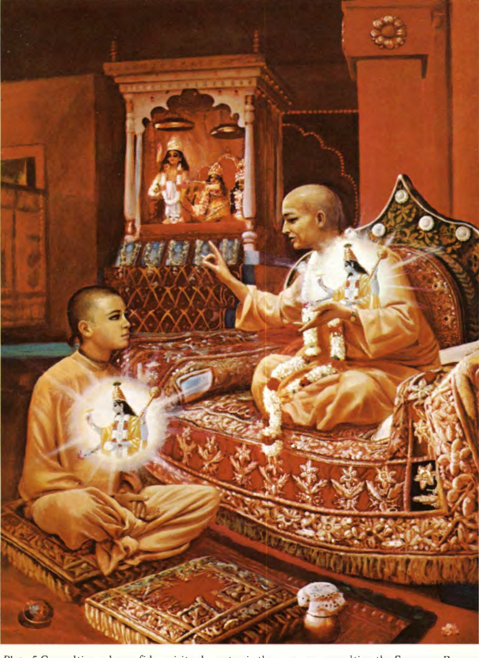
Plate 5 Consulting a bona fide spiritual master is the same as consulting the Supreme Person ality of Godhead personally. (page 1430)